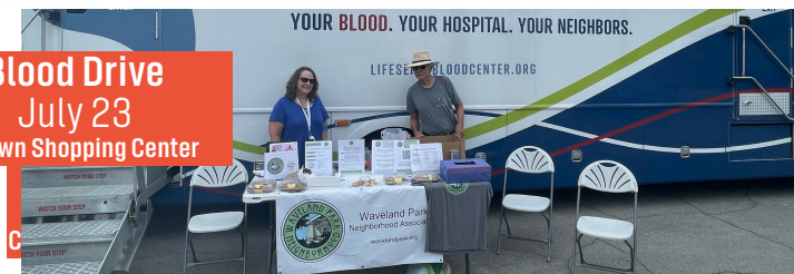
Blood Drive July 23 Uptown Shopping Center