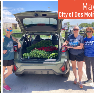
Flower Planting May 16 City of Des Moines Greenhouse