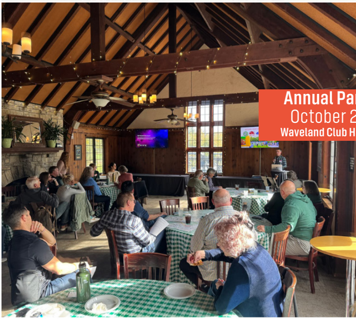
Annual Party October 26 Waveland Club House