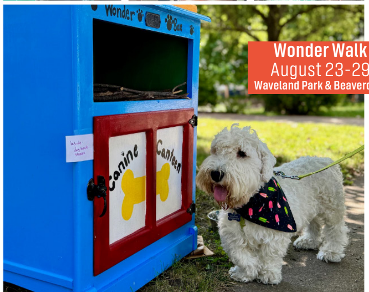
Wonder Walk August 23-29 Waveland Park & Beaverdale