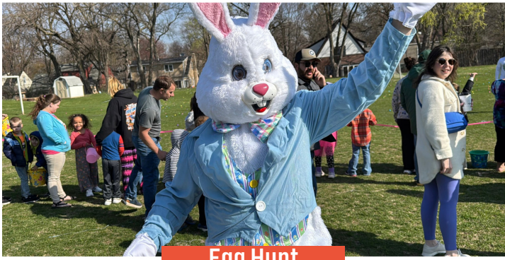
Egg Hunt April 12 Perkins Elementary