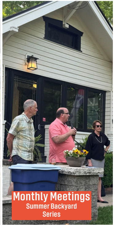
Monthly Meetings Summer Backyard Series